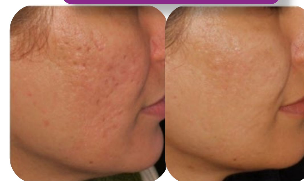
Nilforoushzhadeh et al. , 2020.