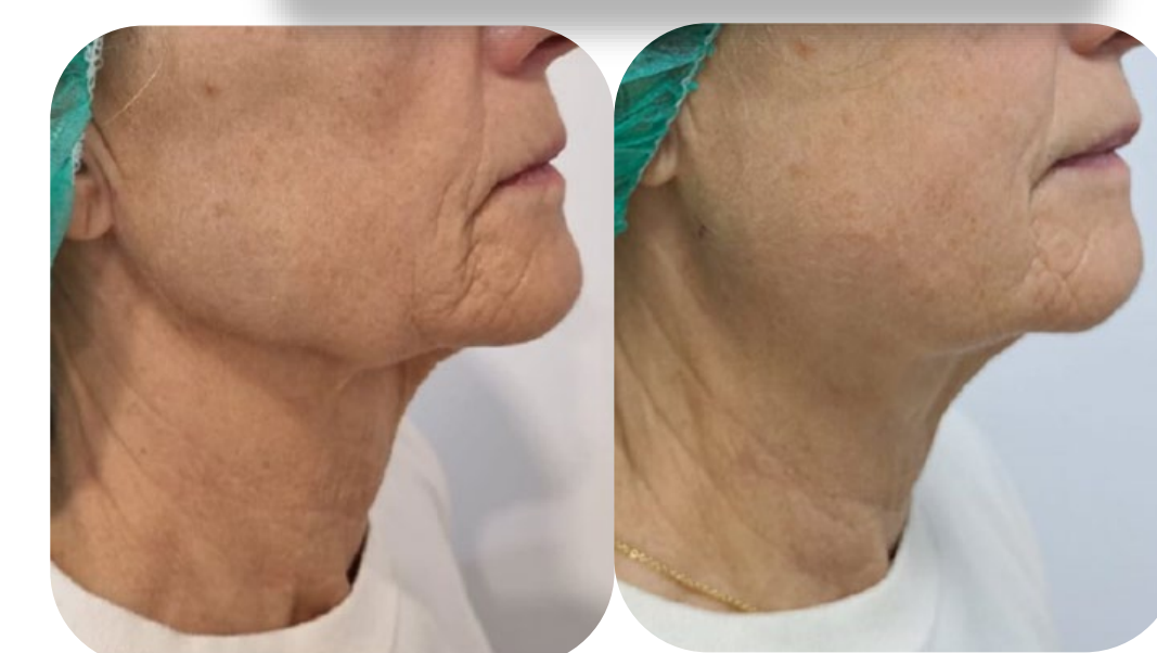
Nilforoushzhadeh et al. , 2021.