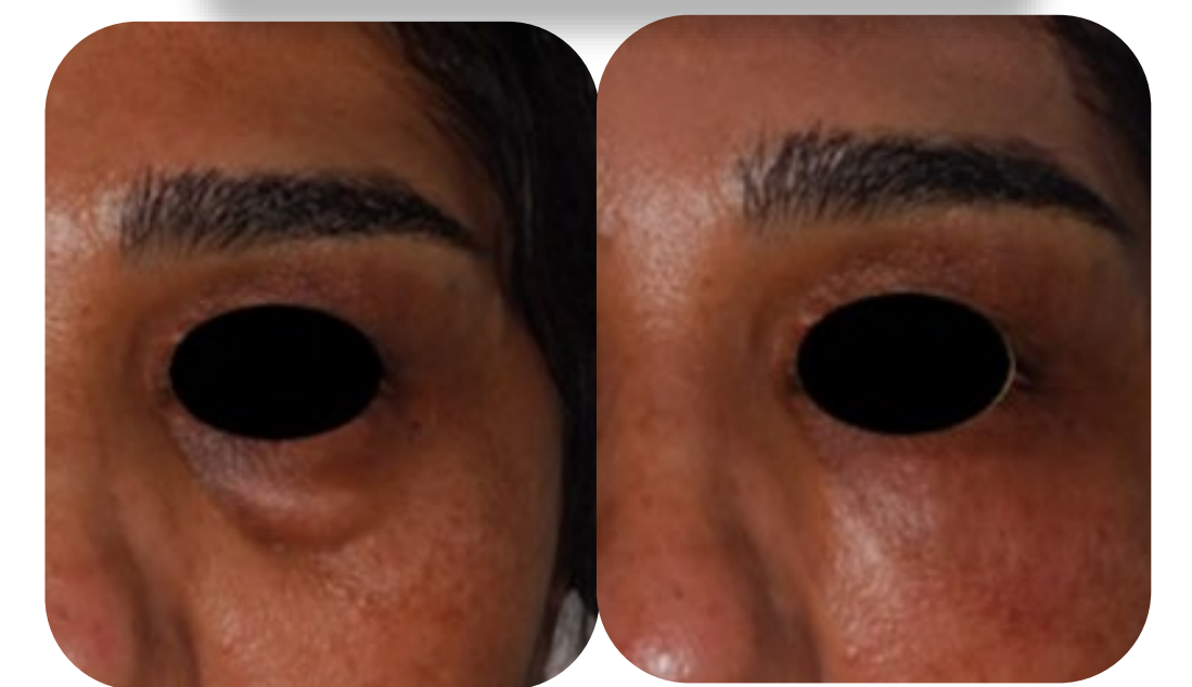
Nilforoushzhadeh et al. , 2022.