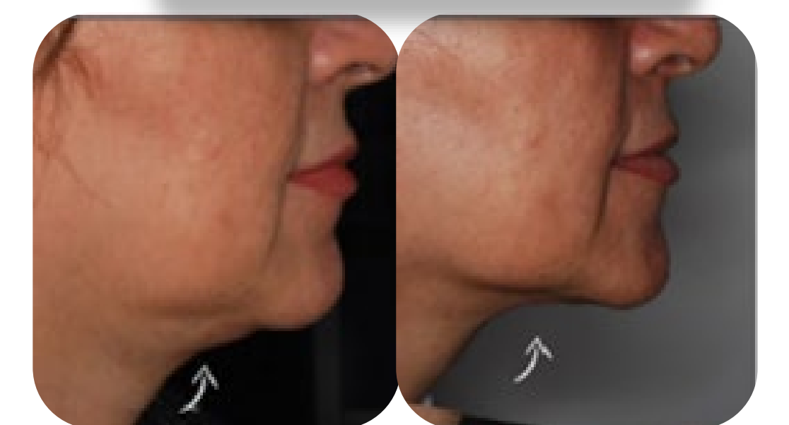
Nilforoushzhadeh et al. , 2022.